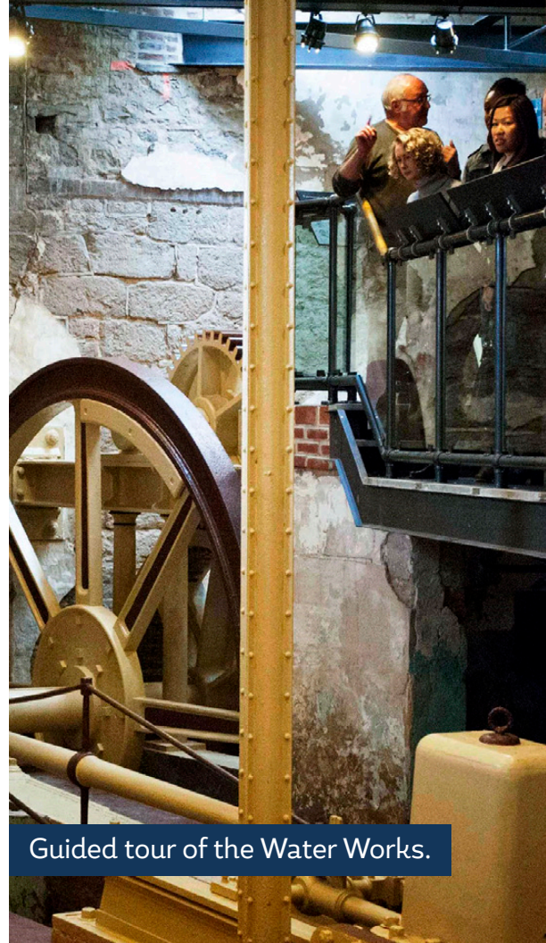
Guided tour of the Water Works.